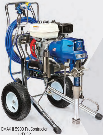
GMAX II 5900 ProContractor 17E832