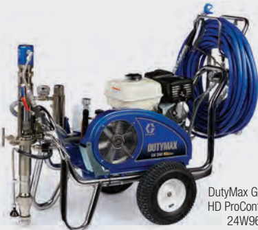
DutyMax GH 300 HD ProContractor 24W967