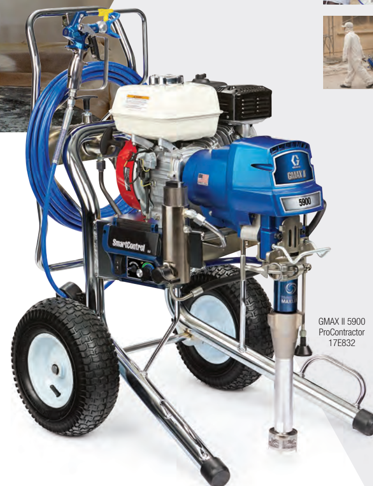
GMAX II 5900 ProContractor 17E832