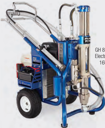
GH 833 with Electric Start 16U288