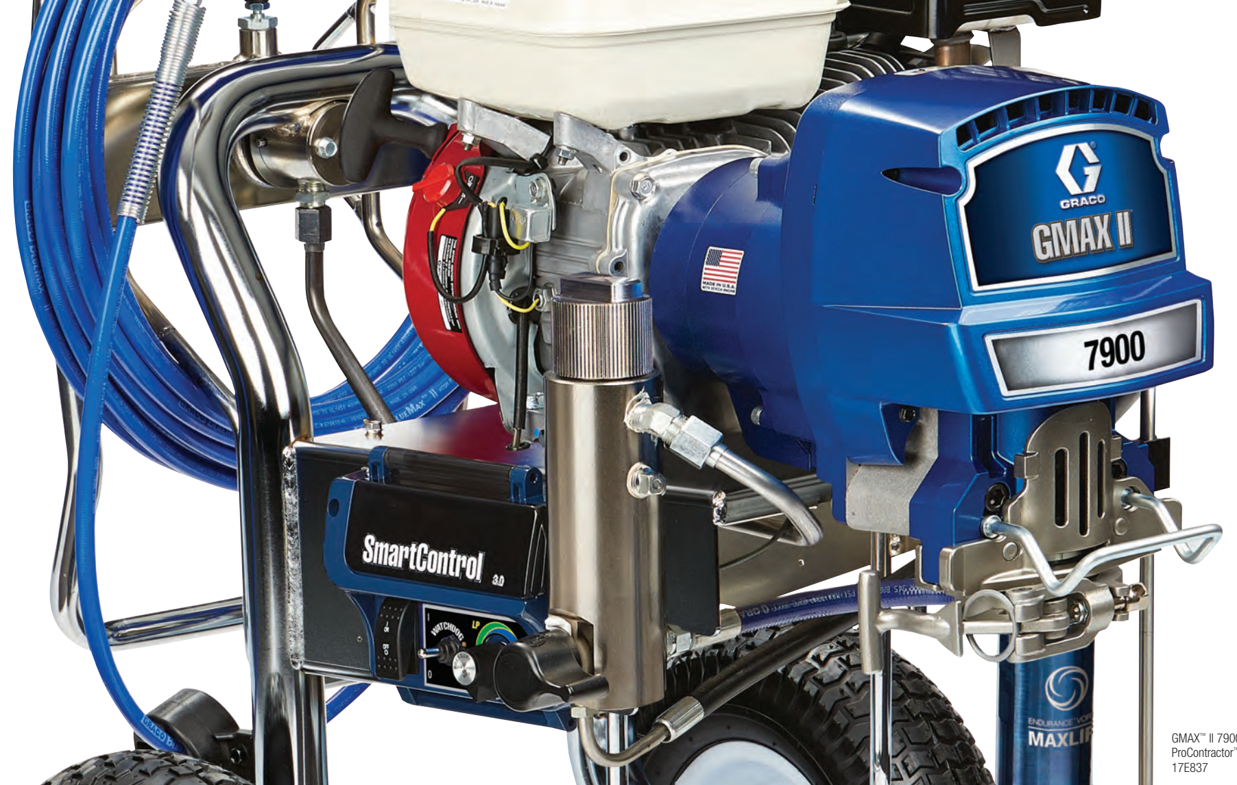
GMAX™ II 7900 ProContractor™ 17E837

Behind every Graco sprayer is the industry's strongest warranty. You may never need Graco's warranty — but if you do, we will be there.