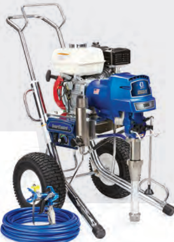
GMAX II 5900 Standard 17E831