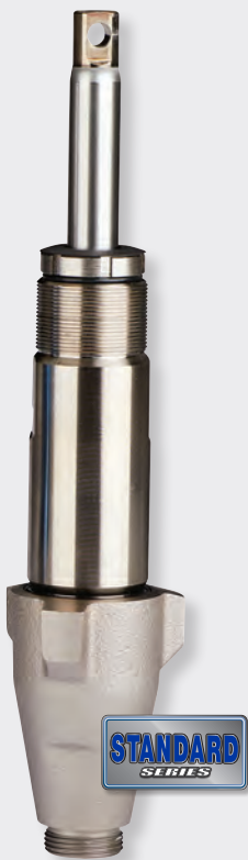
Endurance Chromex™ Pump Lasts 2X longer than competing pumps

QuikPak available on GMAX II 3900 - 7900 Sprayers.