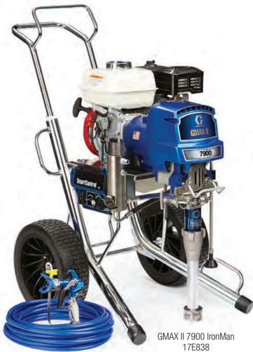
GMAX II 7900 IronMan 17E838