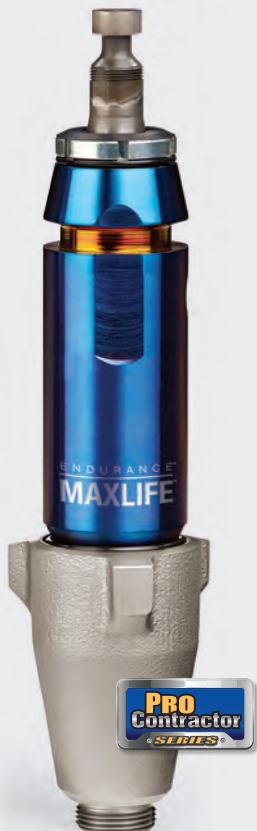
Endurance MaxLife Pump for GH 6X longer between repacks