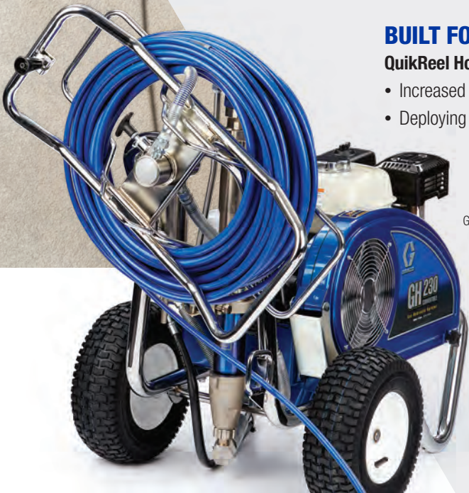
GH 230 Convertible 24W932