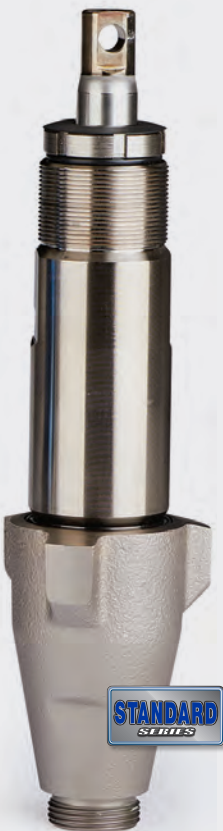
Endurance Chromex Pump for GH Lasts 2X longer than competing pumps

Graco's Standard Series sprayers deliver durability and performance for painting multiple projects a week, time after time.