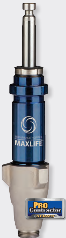
Endurance Vortex MaxLife Pump 6X longer between repacks