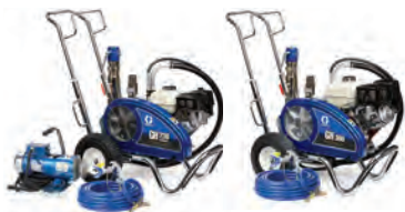
Ready to spray: Complete with Silver Plus Spray Gun, 50 ft Blue Max II Hose and RAC X LP517 SwitchTip