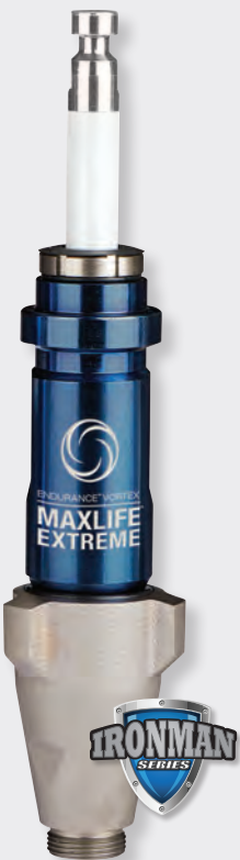
Endurance Vortex MaxLife Extreme Pump Extends pump rod life by 3X — delivering the industry's lowest cost of ownership