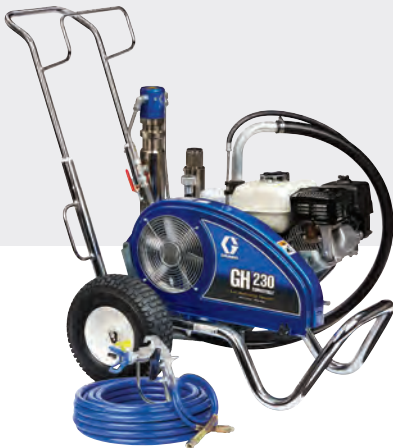
GH 230 Standard 24W929