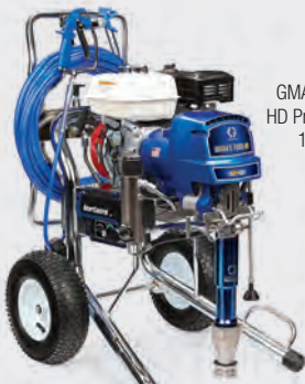
GMAX II 7900 HD ProContractor 17E842